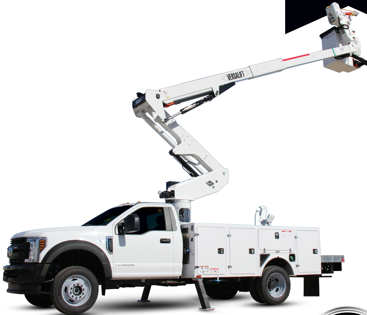
VST-40-I shown with Material Handling option.