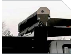
PULL TARP SYSTEM