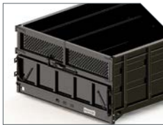
REAR CARGO GATES WITH TAILGATE