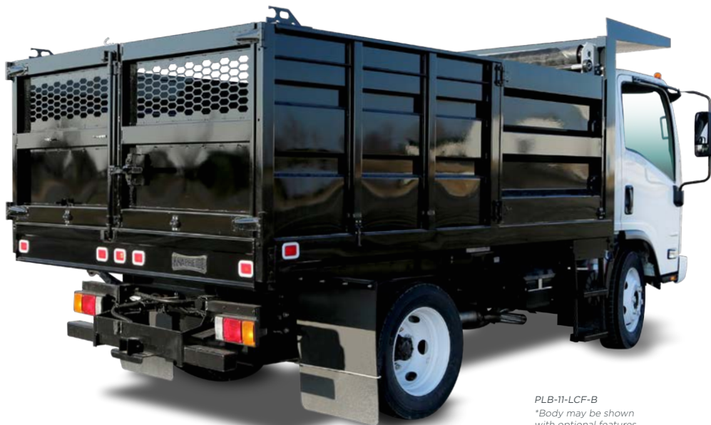
PLB-11-LCF-B *Body may be shown with optional features