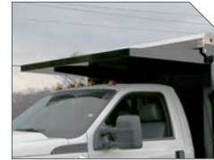
42" CAB PROTECTOR WITH 4 TIE DOWNS