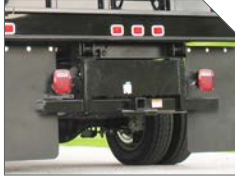
COMBINATION CLASS V HITCH AND ICC BUMPER