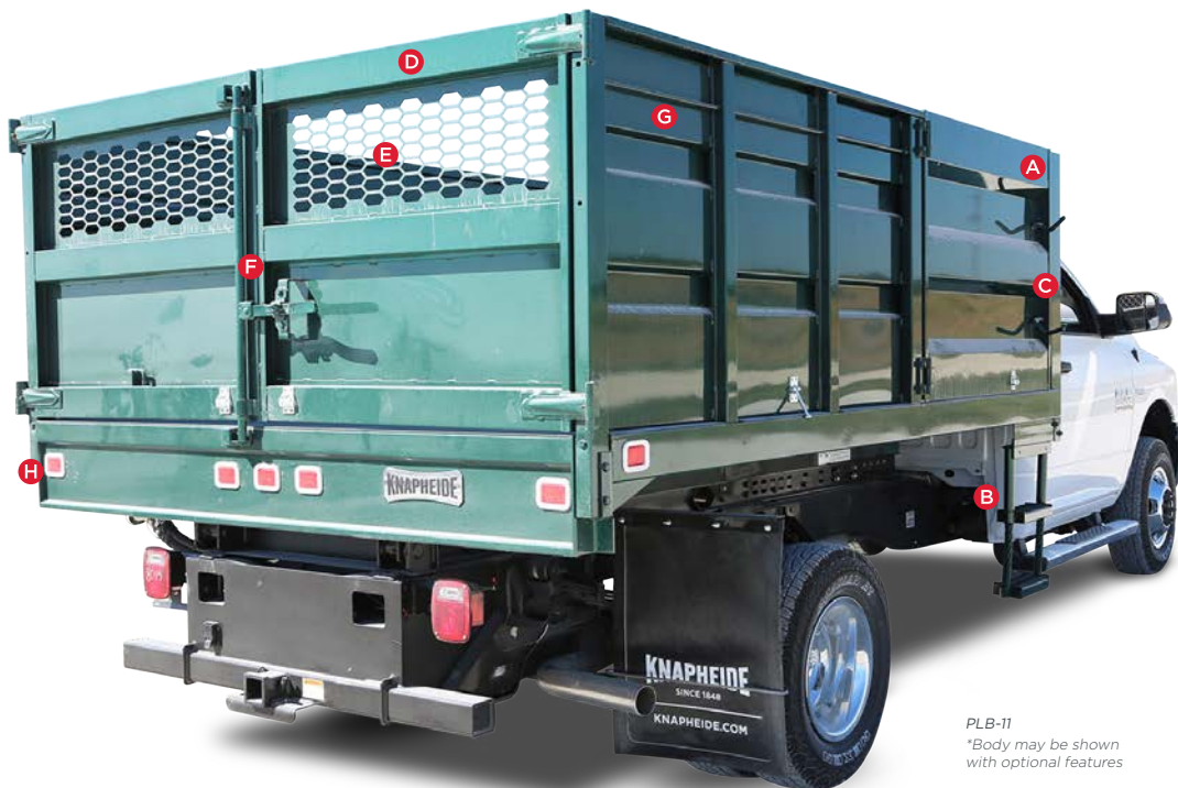
PLB-11 *Body may be shown with optional features

The function and versatility of the Knapheide Landscaper Body is specifically designed for the needs of the landscape contractor. Built with the quality and strength of a Knapheide Platform Body, the versatile Landscaper Body has everything you need to get the job done.