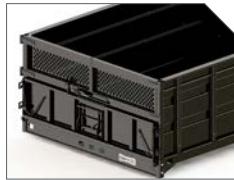
REAR CARGO GATES WITH TAILGATE AND METERING CHUTE